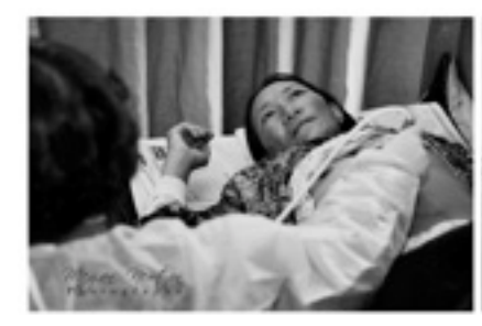
Screening for parasite disease with ultrasound.

Demonstration of screening for echinococcosis using abdominal B-ultrasound was performed in Wumatang village, Damshung County. Originally, 20-30 Tibetans from this village volunteered for the screening. Apparently other villagers learned about the screening after we arrived in the village. We tested a total of 53 adults, including men and women of all ages. The ultrasound detected two cases of CE liver cysts, one inactive and one active. The active cyst was a 4-inch liver lesion in a young woman who was apparently unaware of her infection. Prof. Ito tested her blood sample in a rapid diagnosis kit, which confirmed the infection. The Director-General of the Damshung County Health Bureau and others explained to her how people are infected with CE through accidental ingestion of microscopic parasite eggs. She was then given a regimen of albendazole tablets for treatment of the infection.