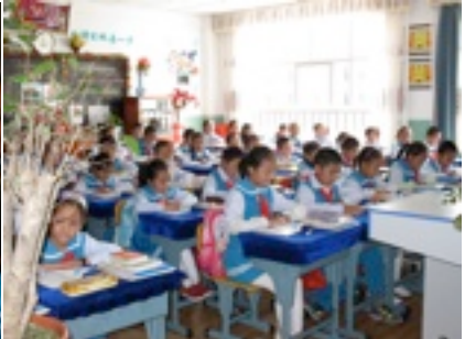
A sixth-grade Tibetan Language class.