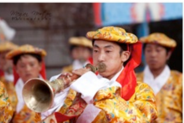
Tibet Chengguan Niang Re Performance Group

We were then treated to a special performance by the Tibet Chengguan Niang Re Performance Group, which is said to be the best in Tibet. They performed several songs and dances, including some traditional Tibetan Opera.